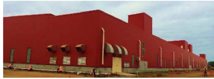
Textile Plant in Angola, South Africa